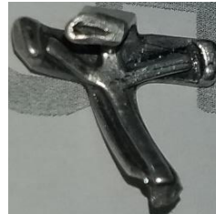
3 rd Place: Curtis H - silver cross