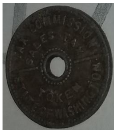
1 st Place: Dean W- Wash tax token