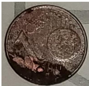
2 nd Place: Curtis H - 1c Euro 2002