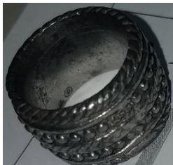
2 nd Place: Dean W - Silver ring