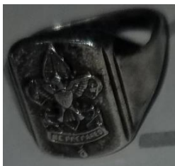
1 st Place: Ken K - Silver cub scout ring