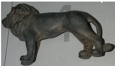
2 nd Place: Ken K - lead lion