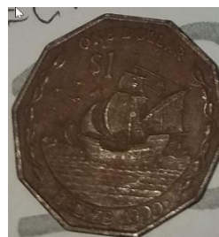
3 rd Place: Jim S - British coin