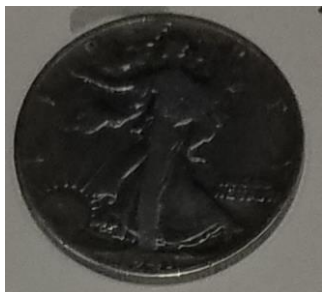
1 st Place: Ken K - 1941 WL Half