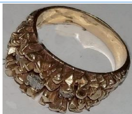
1 st Place: Aaron D - 14K gold nugget ring