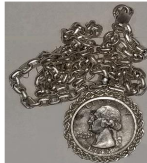
3 rd Place: 1949 Silver quarter pendant