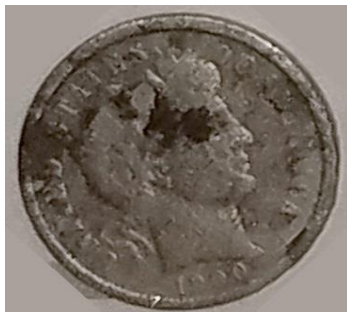
1 st Place: Aaron D - 1900 Barber dime