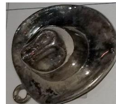
3 rd Place: Ken K - chrome cowboy hat