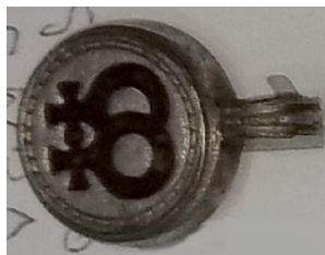
2 nd Place: Jim S - 2 women pendant