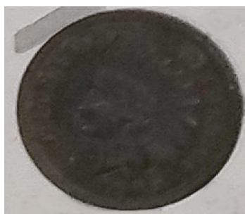
2 nd Place: Dean W - 1880 Indian Cent