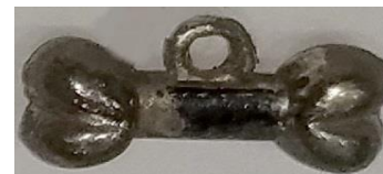
3 rd Place: Ken K - bone charm