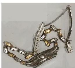
1 st Place: Aaron D - Bulova watch