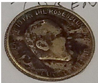
1 st Place: Ken K - 1936 Token