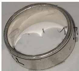
2 nd Place: Jim S - Avery ring