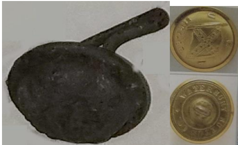
2 nd Place: Aaron D - Confederate button