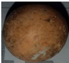
1 st Place: Noah D - clay shooter marble