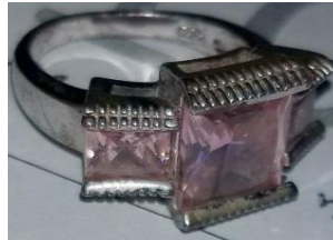
2 nd Place: Jim S - pink zirc ring