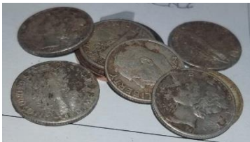
1 st Place: Ken K - 9 coin silver spill