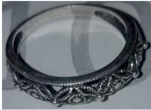
1 st Place: Jim S - Silver ring