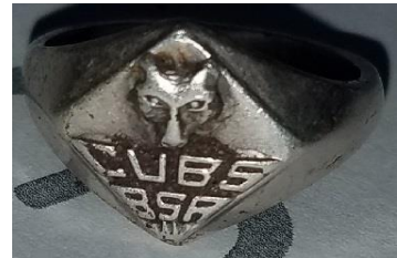
3 rd Place: Dean W - Scouts ring, 50s