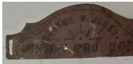
2 nd Place: Gene B - brass plate