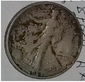
1 st Place: Ken K - 1944 Half Dollar