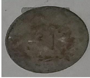
2 nd Place: Aaron D - 1902 V Nickel