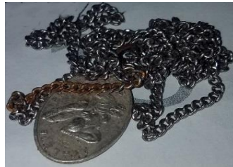
2 nd Place: Aaron S - St Sabastian medel