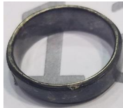
2 nd Place: Mitch W - Silver ring