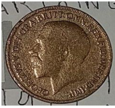
1 st Place: Jim S - British coin