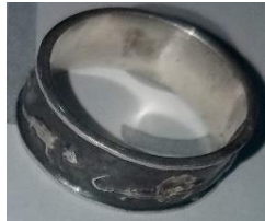
2 nd Place: Bill S - Silver Dino ring