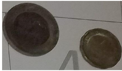
2 nd Place: Steve D - Mexican coins