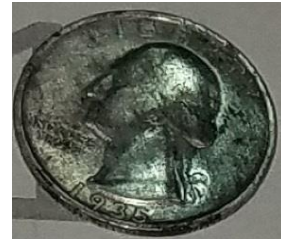
3 rd Place: Ken K - 1936 Silver Qtr