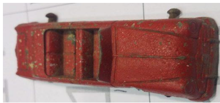
2 nd Place: Dean W - 1940s Tootsie toy