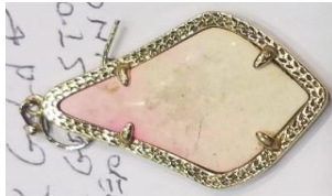
1 st Place: Ken K - 10k gold gemstone