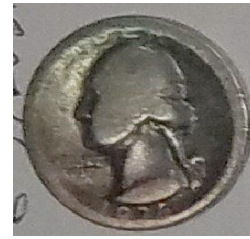
3 rd Place: Ken K - 1935 Silver quarter