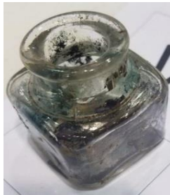
1 st Place: Aaron D - Inkwell