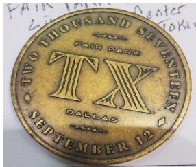
1 st Place: Dean W - Fair park token