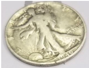
1 st Place: Dean W - 1940 WL Half