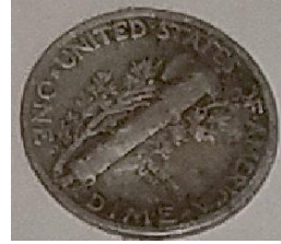
3 rd Place: Ken K - 1940 Merc dime