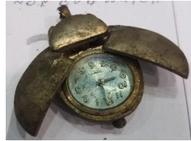
2 nd Place: Tracy J - ladybug watch