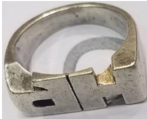
2 nd Place: Ken K - silver ring