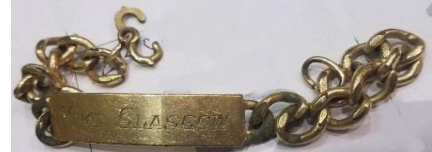
3 rd Place: Dean W - 12K gold bracelet