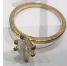
3 rd Place: Mitch W - ring