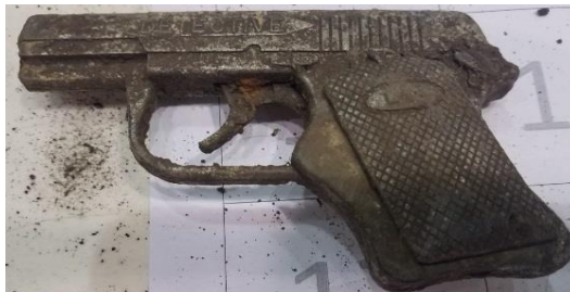
2 nd Place: Mitch W - toy gun