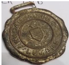
1 st Place: Gene B - lumber yard fob