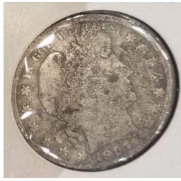
1 st Place: Aaron D - 1907 Barber Half