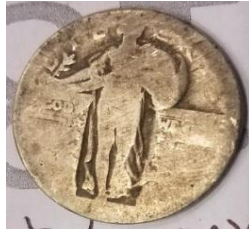
2 nd Place: Bill S - 1917-30 SL Qtr