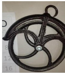
2 nd Place: Gene B - well pulley