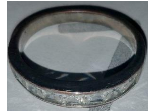
3 rd Place: Mitch W - ring