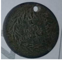
1 st Place: Gene B - 1889 Uno Centavos