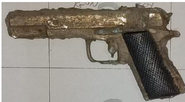
1 st Place: Ken K - Toy gun