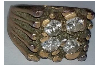
3 rd Place: Mitch W - ring