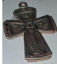
2 nd Place: Gene B - silver cross