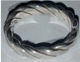
1 st Place: Ken K - Silver ring