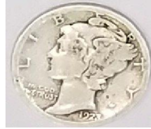
3 rd Place: Mitch W - 1923 Merc dime