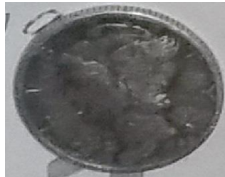
2 nd Place: Dean W - 1942 Merc dime