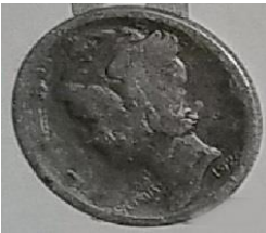
1 st Place: Ken K - 1920 Silver dime