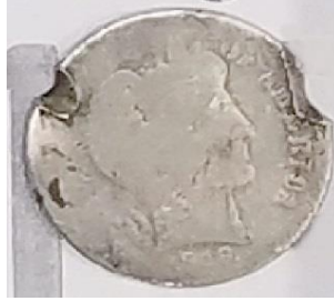
2 nd Place: Tracy J - 1916 Barber dime