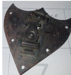
2 nd Place: Gene B - padlock face