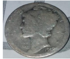
3 rd Place: Bill S - 1919 Merc dime