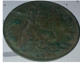
3 rd Place: Mitch W - 1935 1 Penny