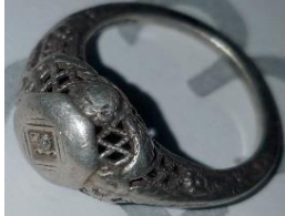
1 st Place: Mitch W - silver ring