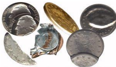
Examples of a few mint error photos found in the Error Coin Price Guide added to CoinNews