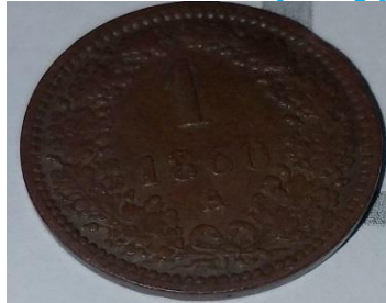
2 nd Place: Bill S - 1860 1 Kreunig