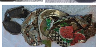
Our club always removes trash from the parks, even dangerous items