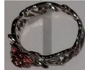
3 rd Place: Aaron D - rose ring