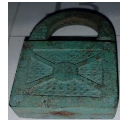
3 rd Place: Sue R - padlock

Thanks to all members who entered their finds in the "Find Of The Month" contest and congratulations to all the winners! Yes, you can win a silver coin at each meeting for your 1 st place winning entry, plus a chance at the year-end prizes!