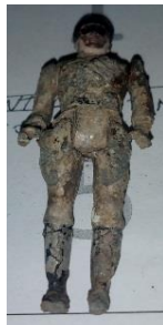
1 st Place: Ken K - WW2 lead soldier