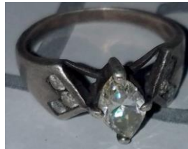
2 nd Place: Mitch W - ladies ring