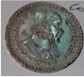
1 st Place: Ken K - Silver Mexican coin