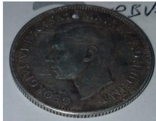
1 st Place: Ken K - 1944 Silver Florin