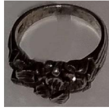
2 nd Place: Ken K - Silver nugget ring