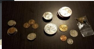
my Night Hunt finds