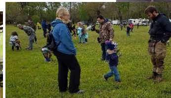
at the Kids Hunt