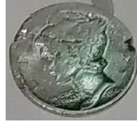
3 rd Place: Ken K - 1944 Merc dime