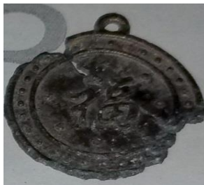
1 st Place: Ken K - medallion