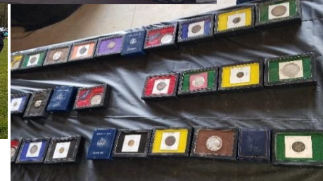
Some of the over 200 Silver Hunt token prizes