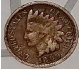
1 st Place: Dave A. - 1899 Indian Cent