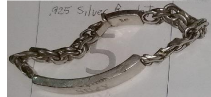
3 rd Place: Terry R - Silver bracelet