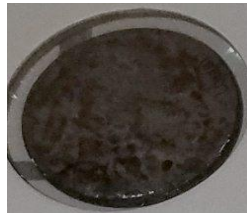
2 nd Place: Aaron D - 1918 Buffalo Nickel