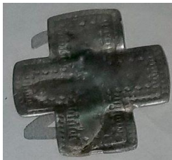
1 st Place: Ken K - Silver earring