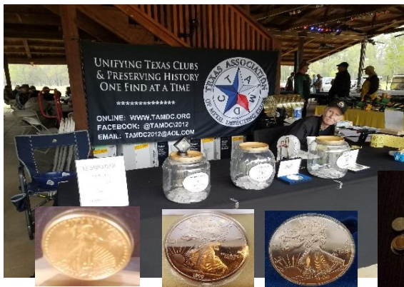
TAMDC had a nice gold coin and large silver rounds in their fundraiser.