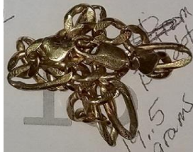
1 st Place: Juan P - 14K bracelet