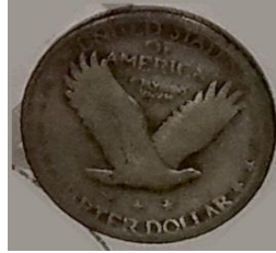
2 nd Place: Layne P - 1928 SL Quarter