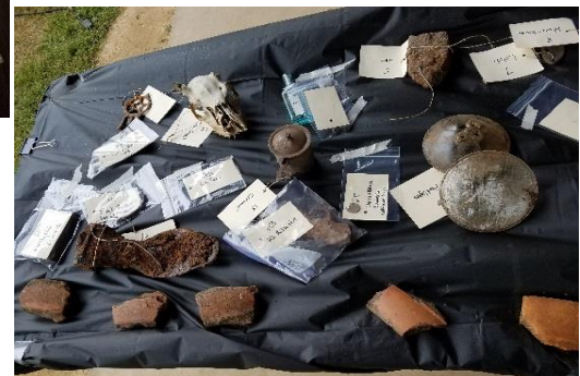
Some of the "Best Finds" not planted.