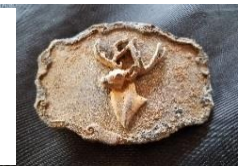
My gold plated Raintree vintage belt buckle find.