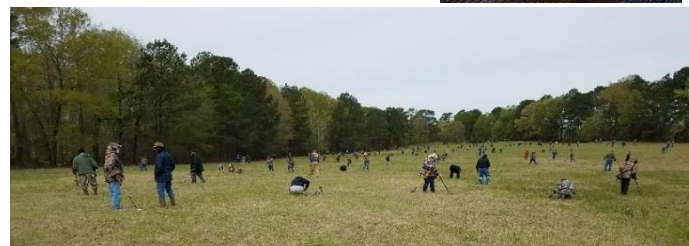
At the Silver Hunt