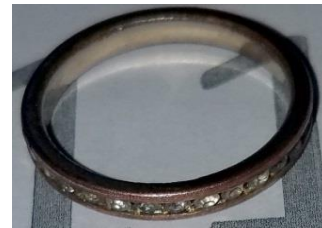
3 rd Place: Bea G - ring with stones