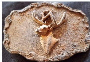
2 nd Place: Steve D - belt buckle