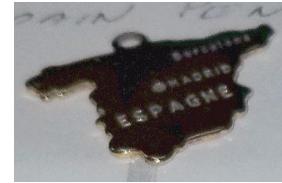
3rd Place: David R - Spain pendant