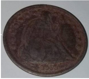
1st Place: Layne P - 1865 Dollar