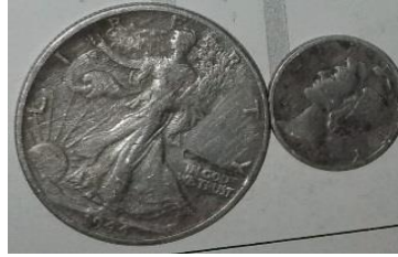
2nd Place: Harold R - Silver Half and Merc same hole