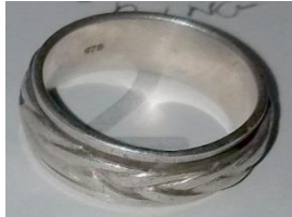
1st Place: Ken K - Silver ring