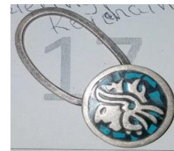
3rd Place: Leticia R - Sterling key chain