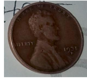
3rd Place: Chase R - 1935-D Wheat Penny