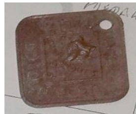
2nd Place: Ken K - Boy Scout Medallion