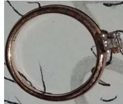
2nd Place: Harold R - Gold Ring