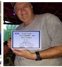
2nd Place: Earl Hitt - 635 points (posthumously)