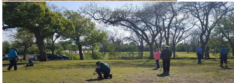
Here is our team at work searching for the hidden token.