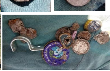
As always our hunters remove stacks of trash that were dug up and disposed of in the trash cans, making it cleaner and safer for everyone!