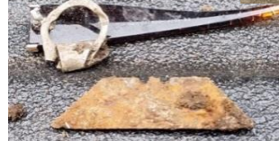
Stacks of trash were removed from the park, especially dangerous stuff like this razor