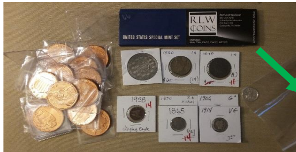
Our coin show finds and the donated Proof set, donated by RLW coins!