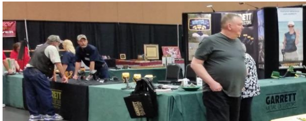
Always lots of activity at the Garrett booth!