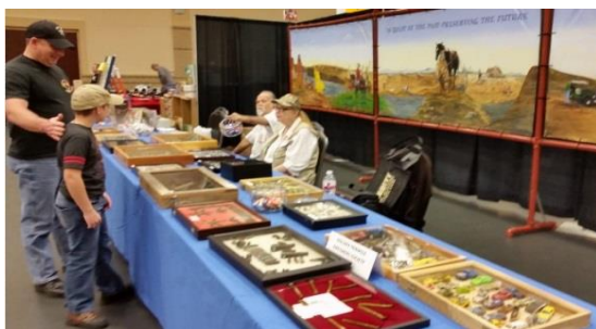
It was nice being located next to our friends at theGTES booth!