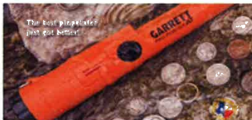
Garrett Pro-Pointer AT 1140900 Waterproof PRO-POINTER® AT Pinpointing Metal... metaldetectingstuff.com

Garrett has an "AT" version of the ProPointer that is WATERPROOF!